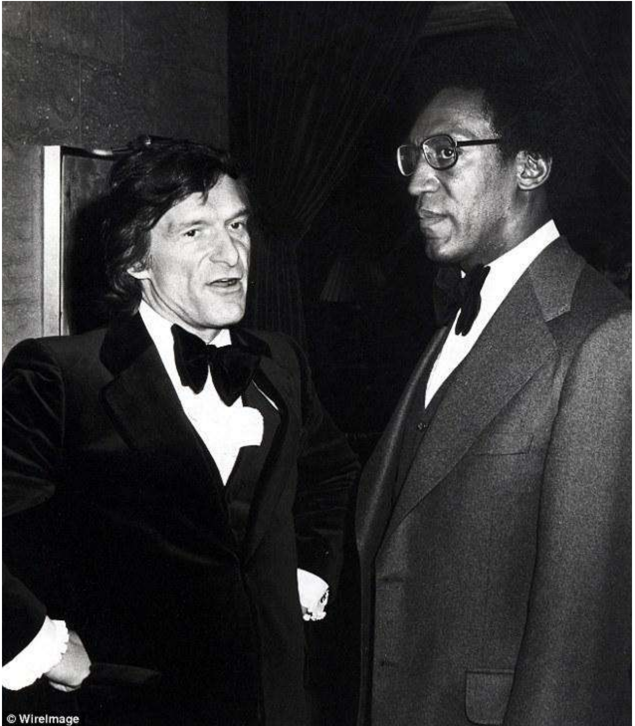
Long association: Hefner and Cosby together. However the Playboy creator has distanced himself from his friend

'We hope that the people who are paying to attend Mr Cosby's shows understand that these victimized women have broken their silence now and they will not remain quiet any longer. Mr Cosby should be held accountable for what he's done.'