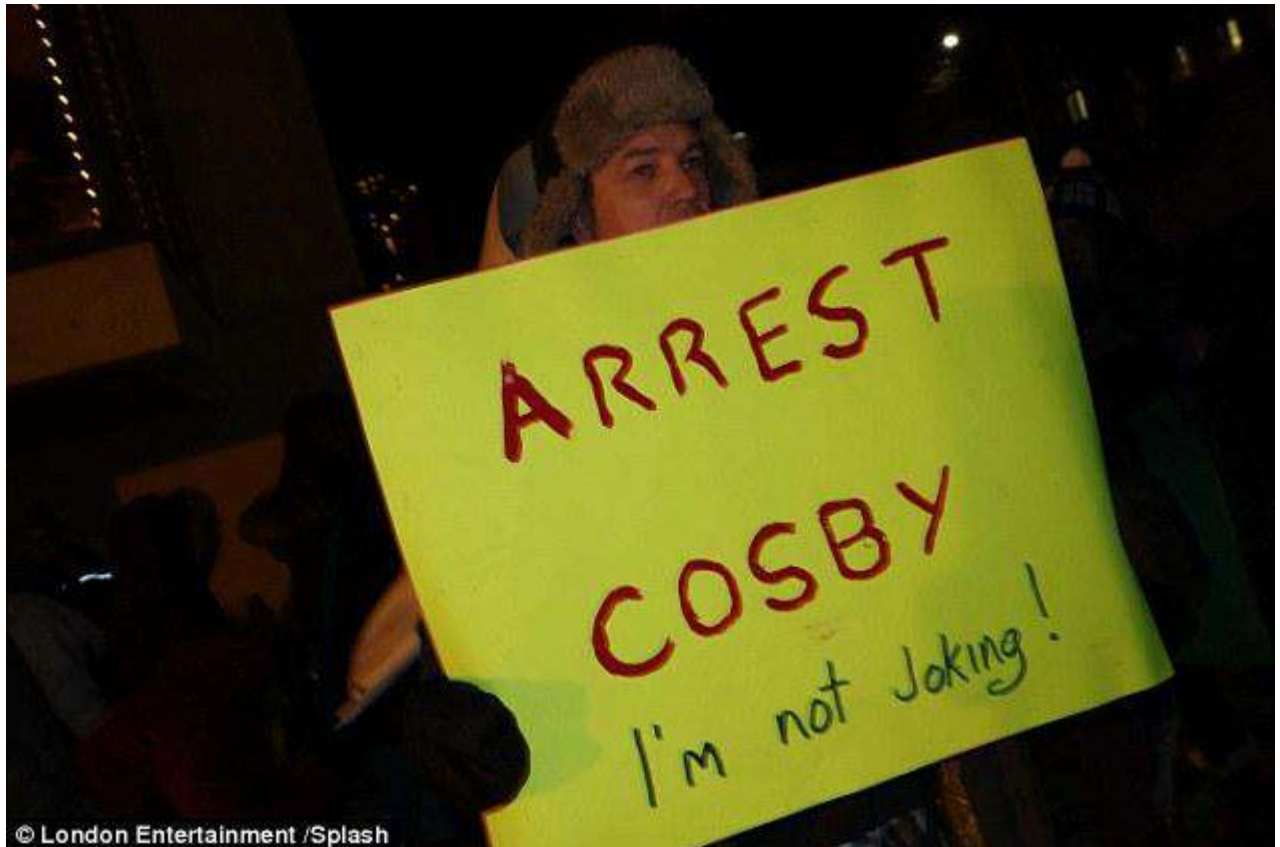
Protest: Demonstrators were outside the Hamilton venue to express anger at Cosby

Cosby is under mounting pressure over the alleged attacks.