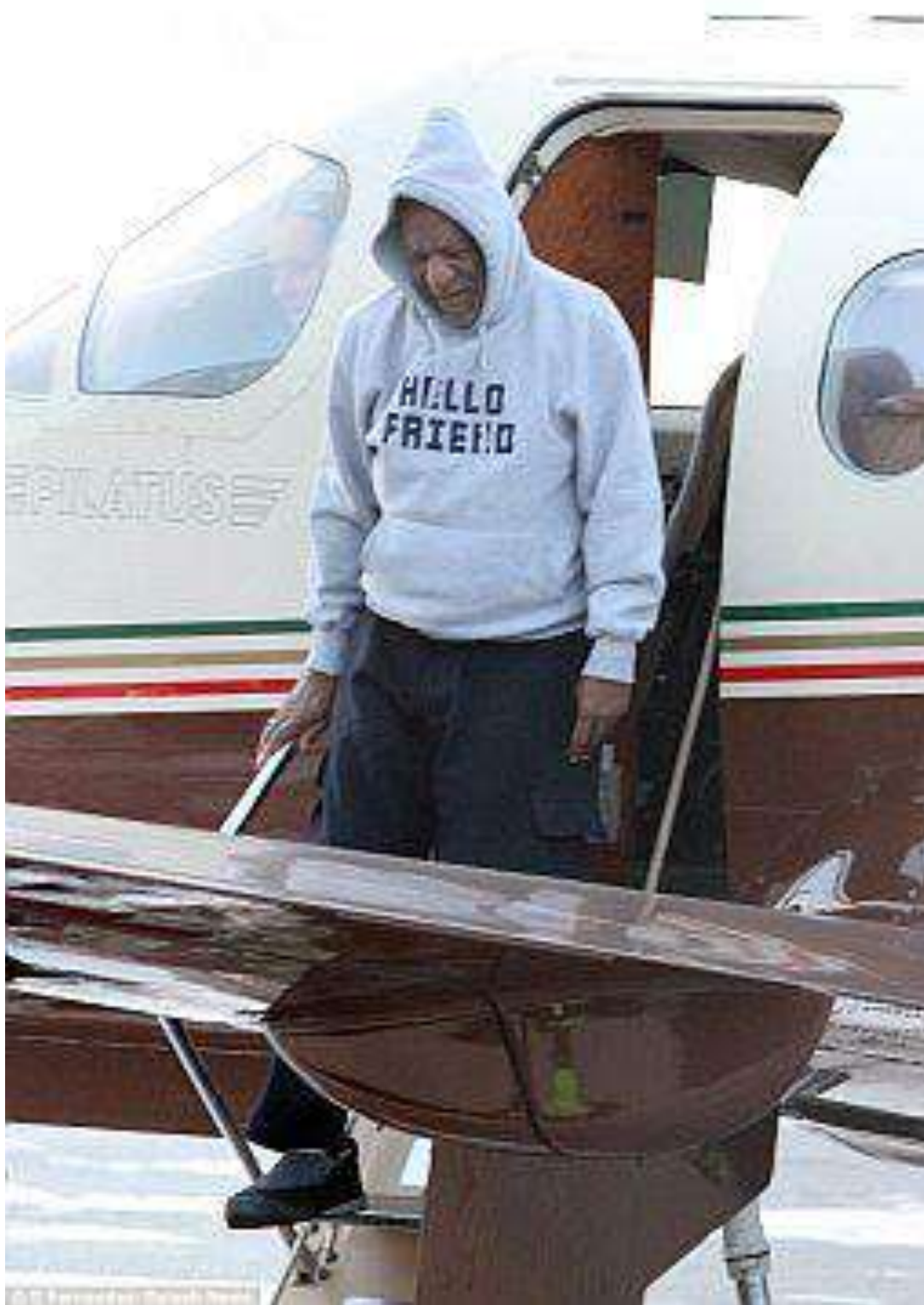
Pressure: Cosby leaves his private plane as he lands in Hamilton, Ontario, for a comedy gig there.