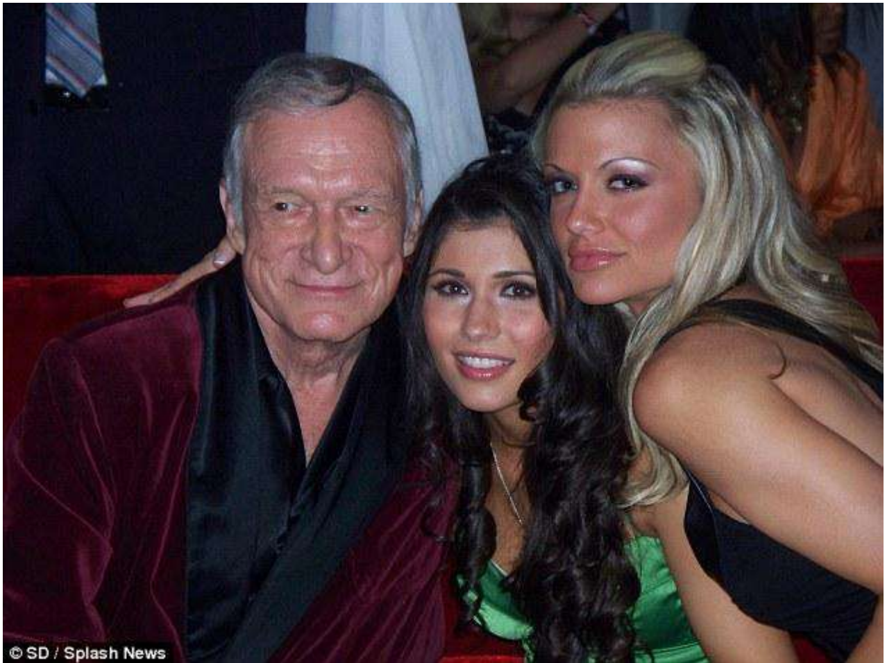
Party time: Another 2008 party at the mansion, with Hefner posing with female guests