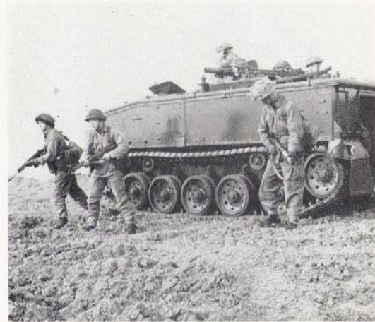
2nd Bn. Grenadier Guards training with an Armoured Personnel Carrier, Wuppertal, Germany.

The armoured car regiment is stationed at Windsor and provides air portable armoured reconnaissance squadrons for the Strategic Reserve.