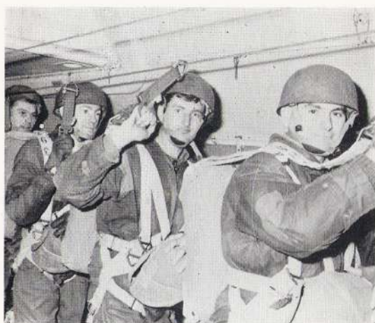
Guardsmen preparing to jump.