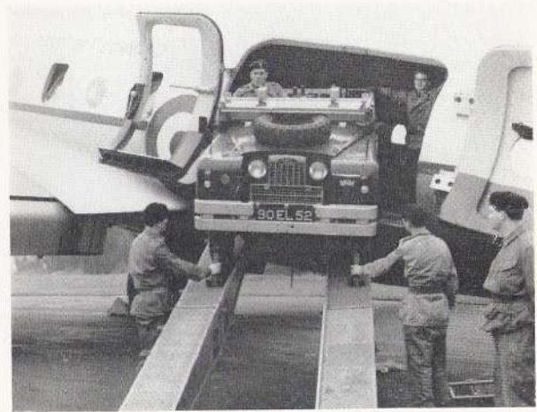
Welsh Guardsmen loading a Land Rover aboard an R.A.F. transport plane.

It returns to Pirbright later this year.