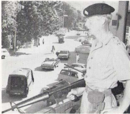
Irish Guardsman manning an observation post in the Crescent, Steamer Point, Aden.