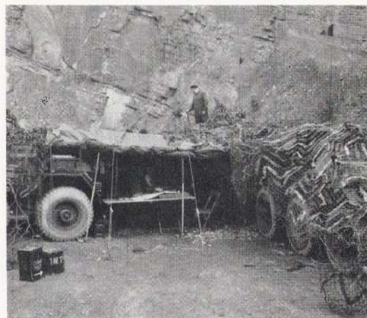
2nd Bn. Scots Guards Command Post on Exercise "Dawn Rise" in Germany.

The 2nd Battalion, which is finding No. 7 Guard, flies to Canada for an exercise next week.