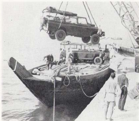
1st Bn. Coldstream Guards loading Landrovers at Bahrain.