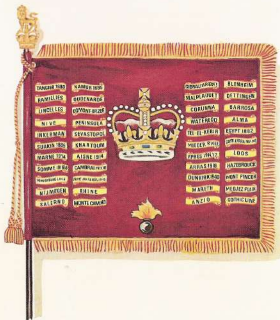
This Colour was presented by Her Majesty Queen Elizabeth II, at Buckingham Palace on 6th June, 1967, and is the Colour being trooped today