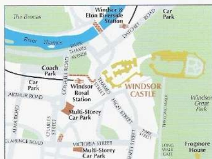
Windsor Castle Frogmore House