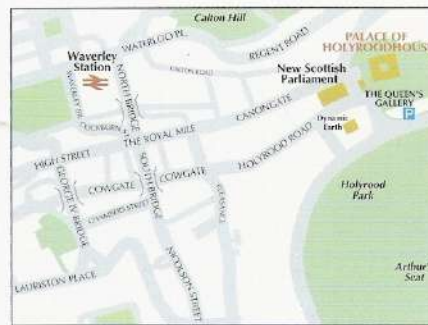
Palace of Holyroodhouse The Queen's Gallery