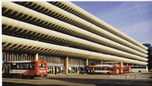
Preston Bus Station

Marking the centenary of the landmark Ancient Monuments Act 1913, five special exhibitions at the Quadriga Gallery highlight the movement to protect England's heritage – from its early days through to the challenges of today.