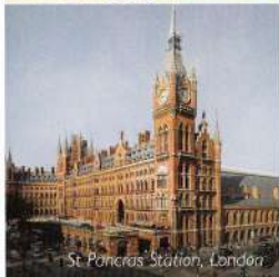
St Pancras Station, London