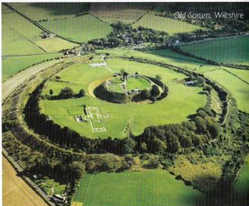
Old Sarum, Wiltshire