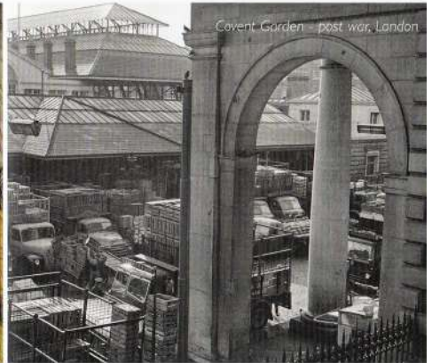
Covent Garden - post war, London