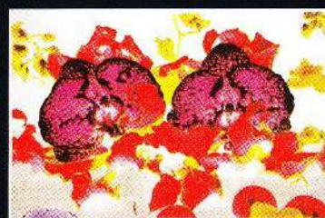
Marc Quinn, Gabi Desert Bloom , 2011