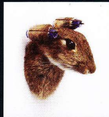
Nancy Fouts, Rabbit with Curlers taxidermy rabbit, 2010 © the artist

@GuildhallArt /visithethecity /GuildhallArtGallery