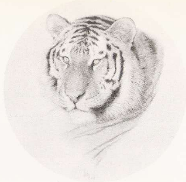
22. Bengal Tiger