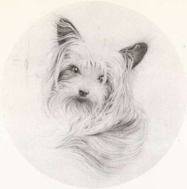
28. Yorkshire Terrier