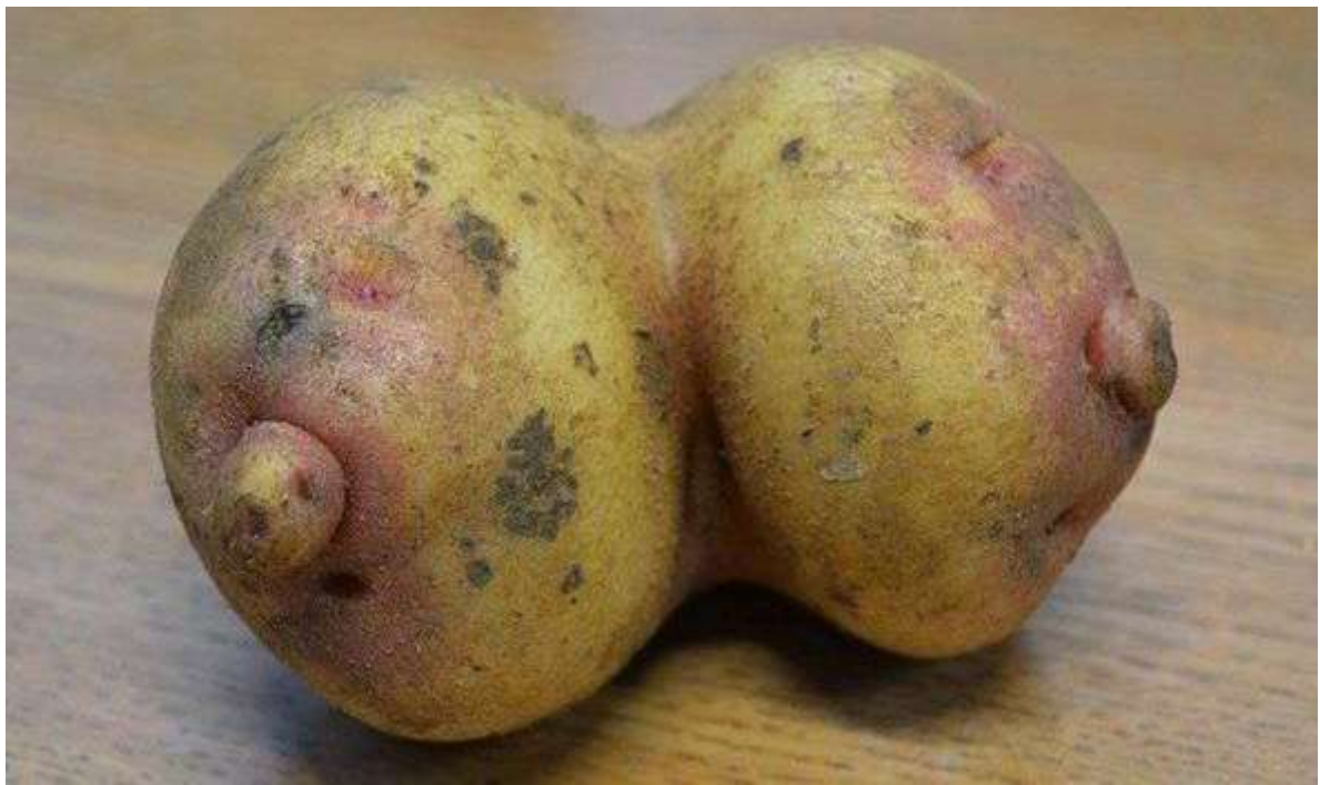
The breast kind of vegetable