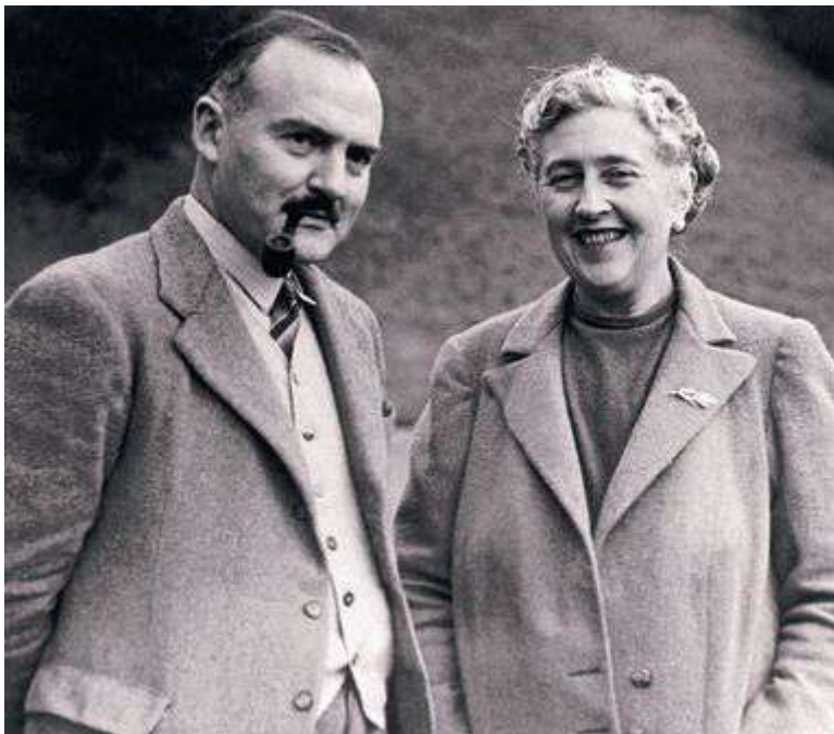
Max Mallowan with his wife, Agatha Christie Mallowan

She married twice, retaining the name of her first husband Archibald Christie , he divorced her in 1928 so he could marry his mistress. The run-up to the divorce saw her famous disappearance; she turned up at an hotel in a different part of the country nearly a fortnight later, something that has never been fully explained, and which has been the subject of much speculation. By this time she was already a fairly famous author; she retained custody of her daughter, and in 1930 married the archaeologist Max Mallowan, although she continued to use the name Agatha Christie professionally.