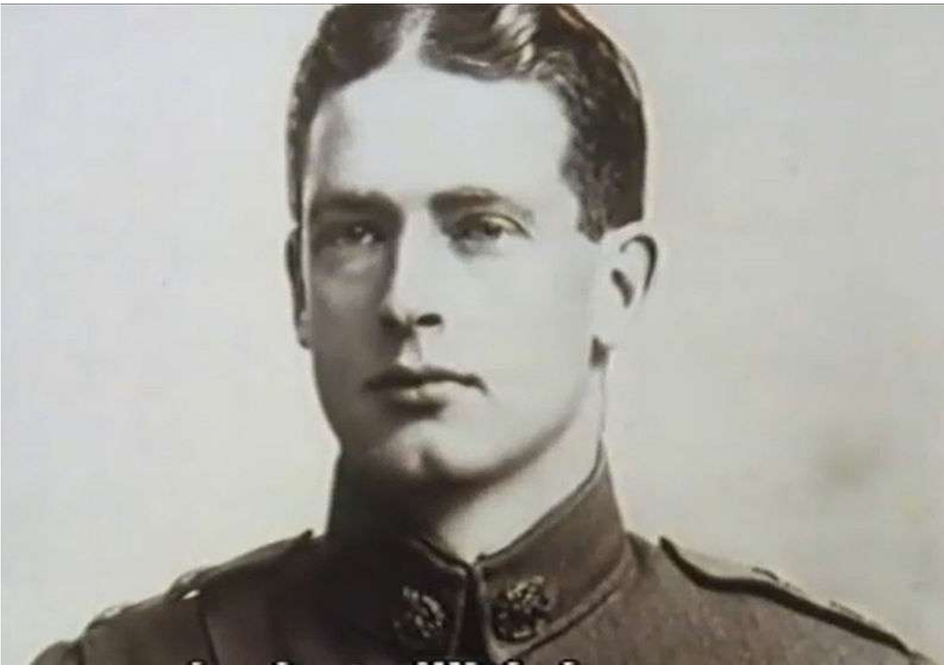
Archibald Christie, 1915 (1889–1962)

She married twice, retaining the name of her first husband Archibald Christie , he divorced her in 1928 so he could marry his mistress. The run-up to the divorce saw her famous disappearance; she turned up at an hotel in a different part of the country nearly a fortnight later, something that has never been fully explained, and which has been the subject of much speculation. By this time she was already a fairly famous author; she retained custody of her daughter, and in 1930 married the archaeologist Max Mallowan, although she continued to use the name Agatha Christie professionally.