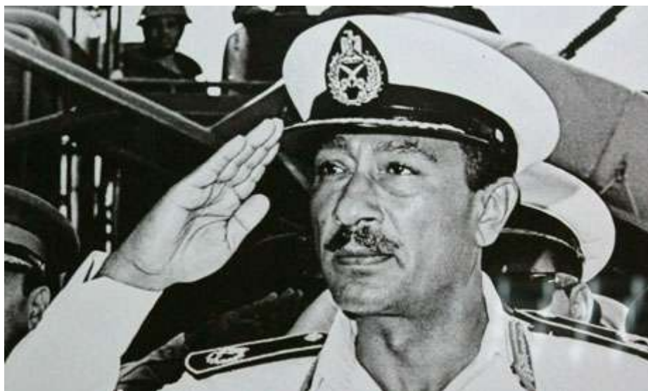
Anwar el Sadat

The greatest scientist of his own or indeed any age was born at Grantham on Christmas Day, 1642. The achievements of Sir Isaac Newton are unparalleled. He formulated the laws of motion and the law of gravitation. He is said famously to have arrived at this latter after an apple hit him on the head while he was sitting in an orchard. Newton also dabbled in optics and made the first practical reflecting telescope. He died at the fairly advanced age of 84, sadly without issue.