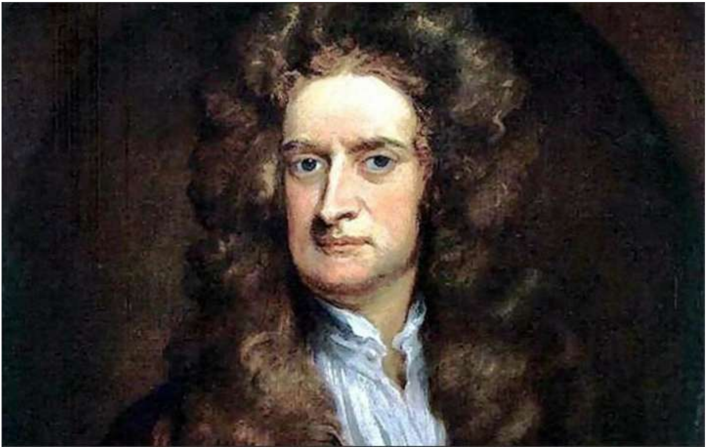
Sir Isaac Newton

The greatest scientist of his own or indeed any age was born at Grantham on Christmas Day, 1642. The achievements of Sir Isaac Newton are unparalleled. He formulated the laws of motion and the law of gravitation. He is said famously to have arrived at this latter after an apple hit him on the head while he was sitting in an orchard. Newton also dabbled in optics and made the first practical reflecting telescope. He died at the fairly advanced age of 84, sadly without issue.