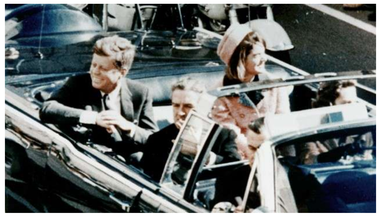
November 22, 1963 - A Day To Remember