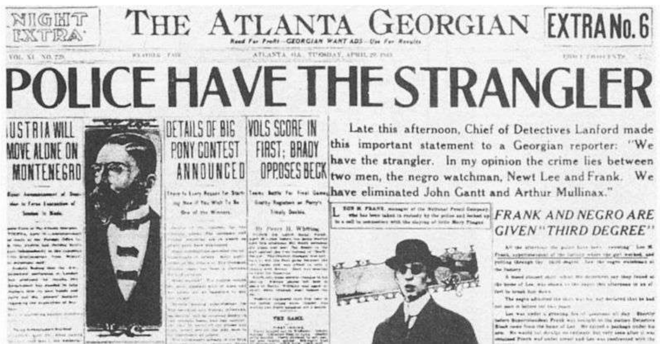
The Atlanta Georgian, April 29, 1913, announcing that the police are closing in on Leo Frank for the murder of Mary Phagan