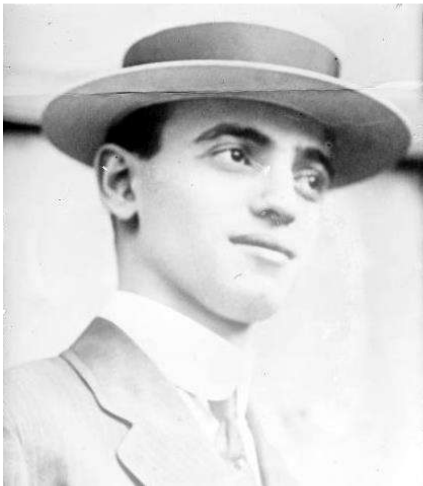
Leo Frank was lynched in Georgia in 1915.

appeals, but in May 1915, his sentence was commuted, and it was this that so enraged the good citizens of Atlanta that they organised a posse, and with official compliance sprung Frank from prison and murdered him.