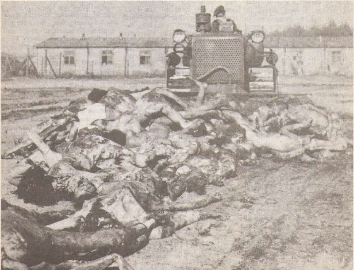
... and the truth