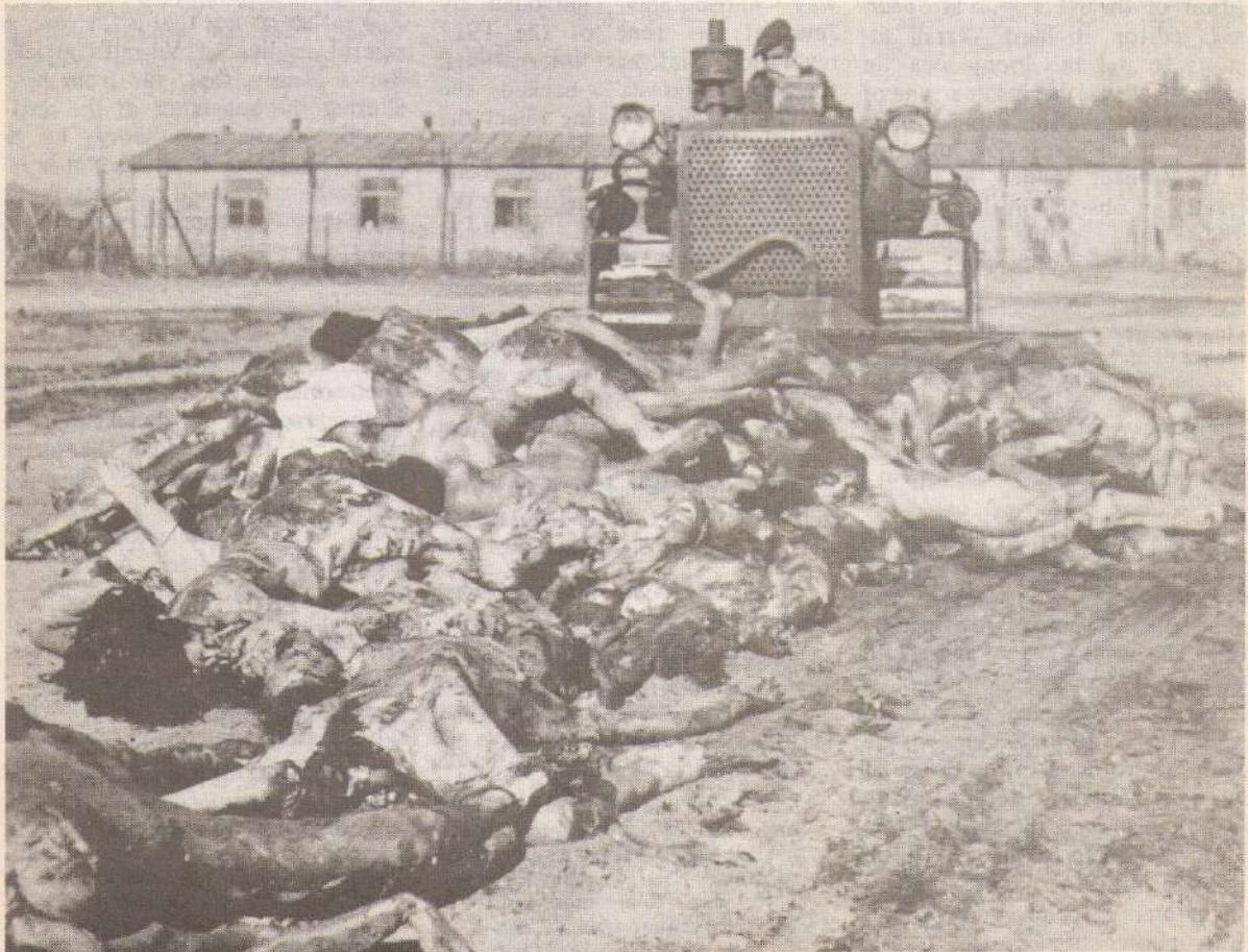
... and the truth