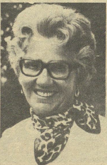
Ms Mary Whitehouse