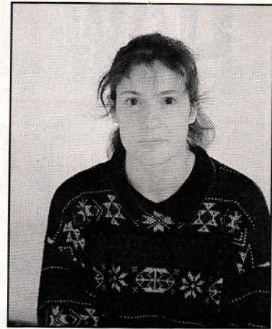
Our page 5 model before her transformation by The Picture House.