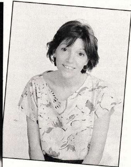
On reflection . . . two views of the same model.