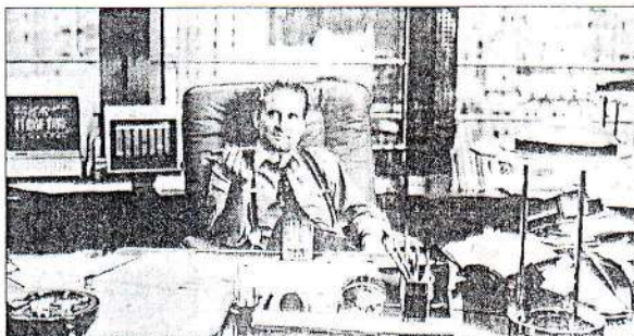
Unacceptable: Michael Douglas as Gordon Gekko in Wall Street