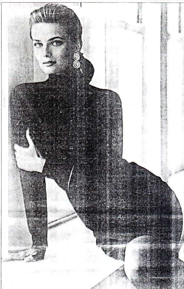
Paulina Porizkova turned down a £3 million contract to protect her husband

I do not think that we will ever revert to the full carefree individualism of the Sixties, but work is no longer the be all and end all of existence, and heroes are no longer men of unimaginable wealth. People need freedom of spirit.