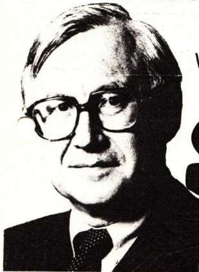
LORD WILLIAM REES-MOGG Chairman of the Broadcasting Standards Council GUEST SPEAKER

We are greatly honoured that he has accepted our invitation to address this very special occasion.