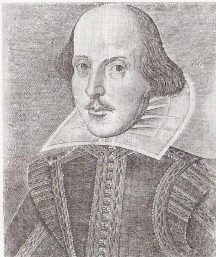
The Droeshout Engraving of Shakespeare, on the title page of the First Folio, 1623.

By 1923, under the management of Lilian Baylis, the Old Vic had over a period of nine years completed the entire Folio, and was the first theatre in the world to have done so.