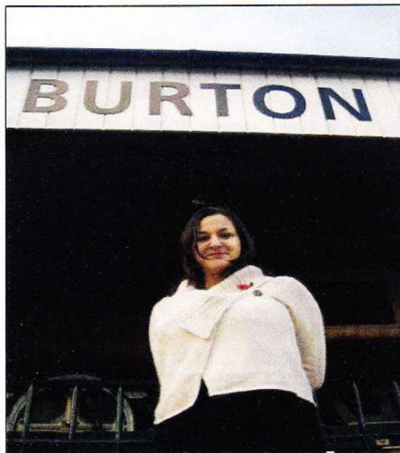
Ruth "44 DD" Smeeth