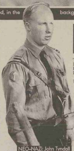
NEO-NAZI: John Tyndall