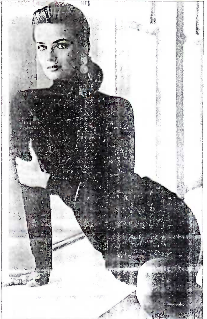
Paulina Porizkova turned down a £3 million contract to protect her husband

Of course, the sheer excess of the period was exciting. I remember three young raiders going on an expedition to a nightclub in Nottingham, one in his Porsche, one in his Ferrari, one in a new BMW. Did they pull? Does the Pope live in