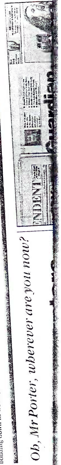
Ob, Mr Porter, wherever are you now?

Newland won't reveal how many members the White Brothers have, so it would be easy to dismiss him as the Walter Mitty of the men's movement. But the Brothers are indicative of a growing state of mind among British men. As I leave, Newland points out that they are the acceptable face of male discontent: "But if people don't take us seriously and do something about our problems, then some nasty version of us will come along." And you can take that as a prophecy or a threat.