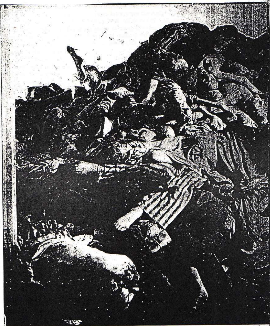
. . . SOME OF THE GASED . . . Dachau