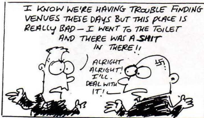
4 Searchlight, November 1994